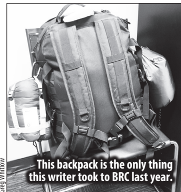
This backpack is the only thing this writer took to BRC last year.

When I went the previous year, we spent probably eight months preparing for Burning Man. I thought to myself, "How am I going to cram all of this into a couple of days?"