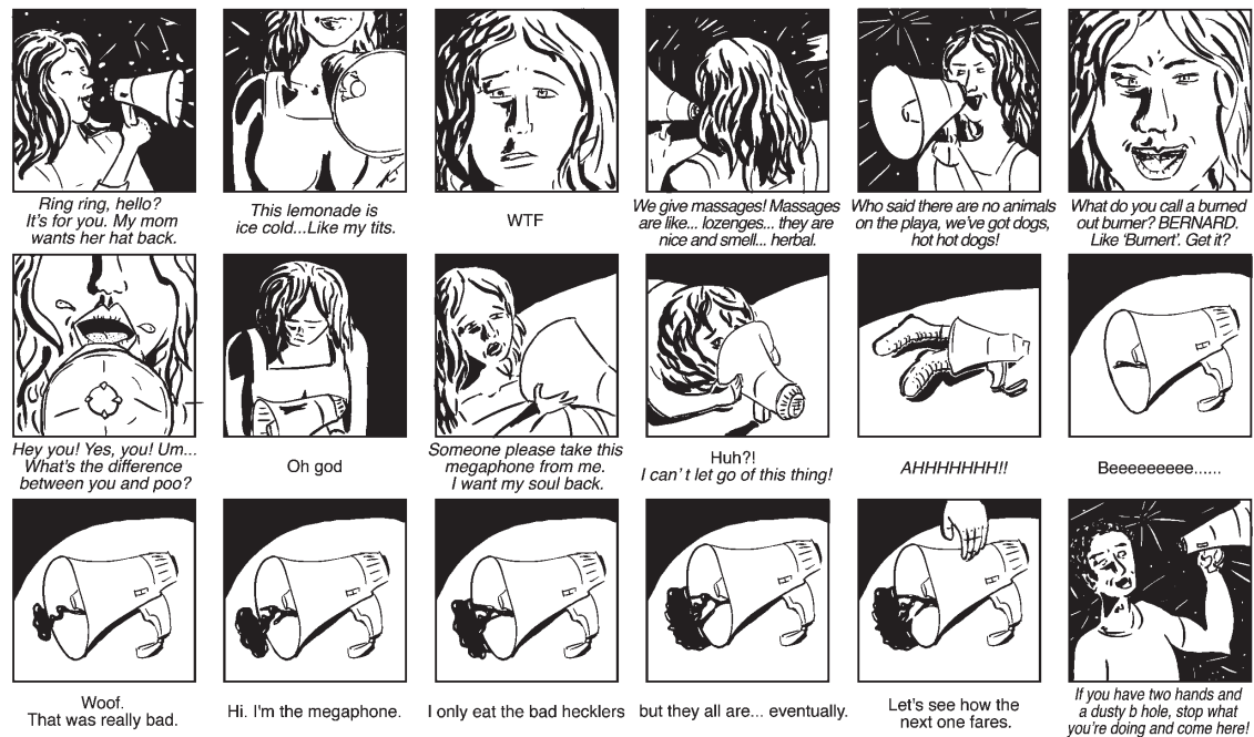
Woof. That was really bad. Hi, I'm the megaphone. I only eat the bad hecklers but they all are... eventually.