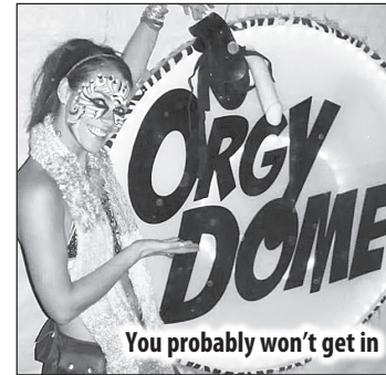
You probably won't get in

Of course, getting naked doesn't automatically get you laid (depending on how hot you are) but it certainly sets the tone for your conversation. If you're actively flirting while naked, it's the sexual equivalent of putting out those Costco samples: you're giving the