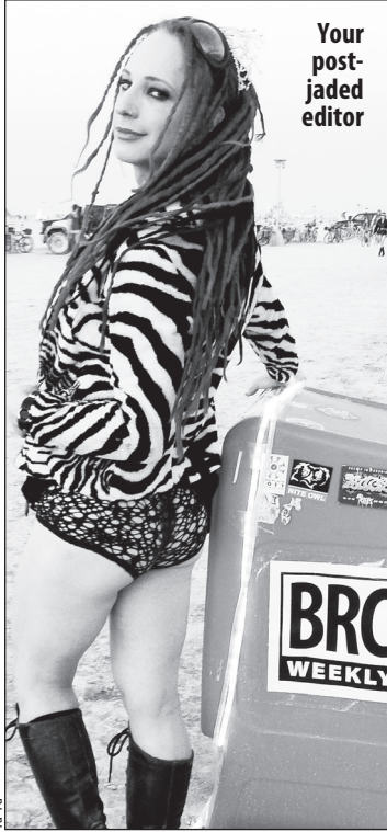
Your post-jaded editor